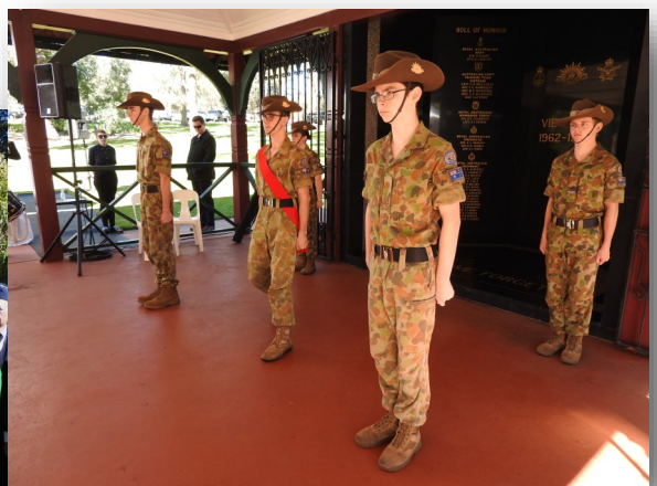
Above: 502 Cadet Unit Karrakatta. Left: Ladies from the Vietnamese Community in traditional dress.