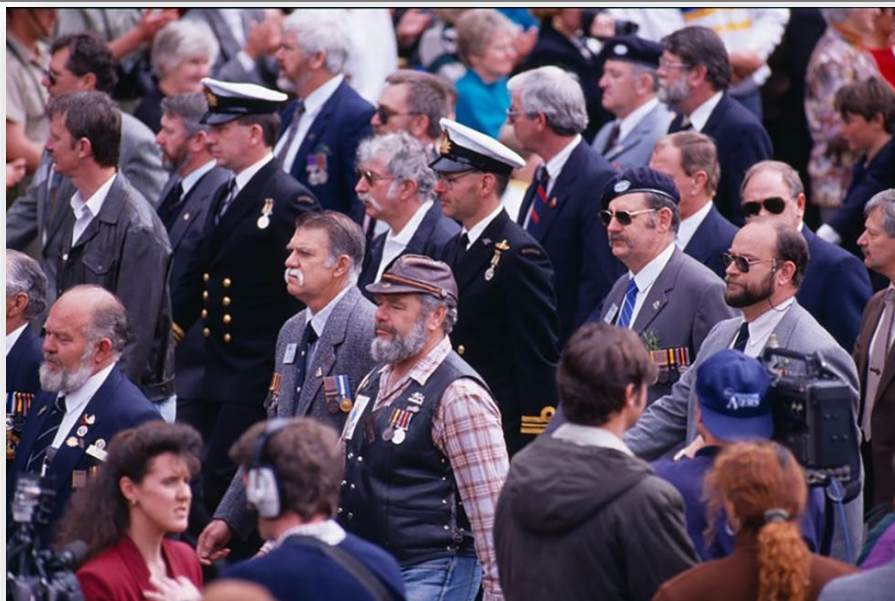
Photo: Vietnam Veterans marching at the dedication of the Australian Vietnam Forces National Memorial on Anzac Parade in Canberra on 3 October 1992.

About 25,000 veterans took part in the march, going on for half of the 60,000 Australians who served in the Vietnam theatre of war, and for many of those participating the march served as a belated welcome home parade. There had been no national celebration or victory parade in the 1970s because the War had been deeply divisive and ended in withdrawal. It was not until 1987 that the Vietnam Veterans Association of Australia was able to organise a major national parade in Sydney.